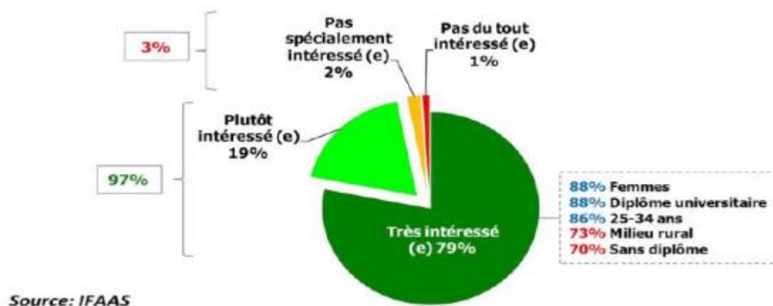
Figure 1. Attractiveness of Islamic finance products

which makes it possible to validate, or create, a relationship of trust. In this process, the user-borrower is a co-producer of the expression of needs [8] in figure 1,